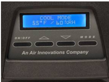
Front Digital Display