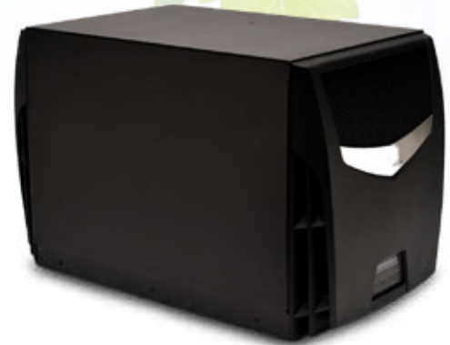
TTW unit out of racking