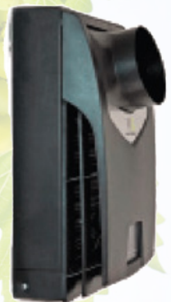
Back View With Optional Duct Adapter